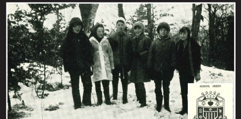
First years students at Colomendy, March 1969.