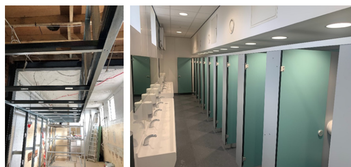
Pupils were involved in choosing the colour scheme and are really pleased with how they have turned out, referring to them as boujje!

We are delighted that the new toilets have been completed over the Easter break. This took longer than expected but the toilets are of a high specification and we are pleased with how they look. The toilets will be for Year 11 pupils at break and during their lunch. This will reduce waiting times for our pupils at break and lunch – especially for Year 11. This has been a significant investment by the school and reflects the pupil voice that requested more toilets to be available at break and lunch time.